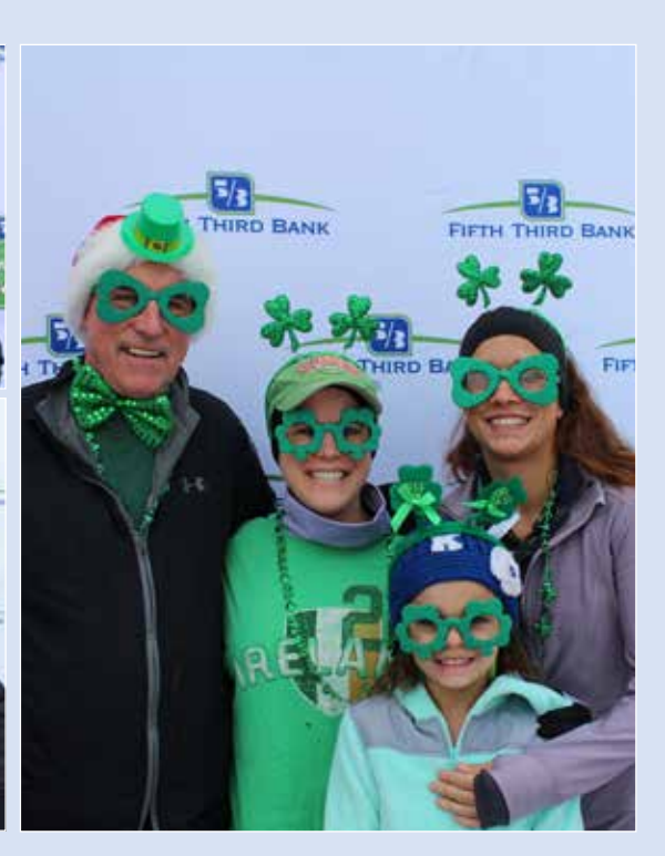
The Leapin' Leprechaun 5K took place March 16 this year, with the National Cherry Festival choosing to give proceeds of this fun run to the Family Birth and Children's Center. More than 900 people (and many four-legged companions) braved the wind and snow to show support for our littlest patients.